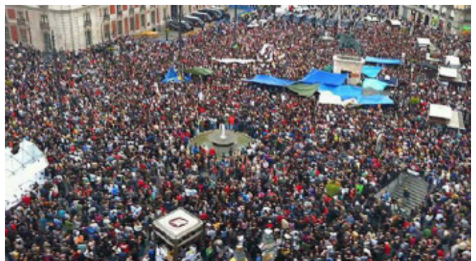
Italians protest mandatory vaccinations on July 22, 2017

Holland also tackles the extensive collusion between the pharmaceutical industry and government regulators, including a quote about “ravenous corporate greed and mindless bureaucracy” in a related article . 8 Whereas “demonstrably predatory corporations selling compulsory products to a vulnerable population should lead to a high level of government scrutiny and skepticism,” Holland observes that “government appears to ally its interests with industry 9 in the arena of vaccines.”